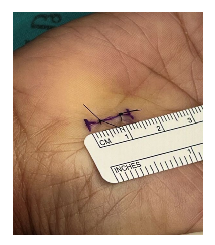
Figure 4. The wound after stitching, with a size of 1.5 cm.

The operation started from the administration of anesthesia to numb the hand and wrist of the patient. Then, the surgeon proceeded with the incision surgery, making a 1.5-cm cut on the palm and utilizing surgical instrument to dissect the carpal ligament and widen the carpal tunnel. After that, the wound was closed by stitching (Figure 4), with the wound size approximately 1.5 cm. This is smaller compared to the wound size in the classic CTS operations, which typically measure 5 cm (Liawrungrueang and Wongsiri, 2020). The operation duration was brief, taking only 10 - 15 min, which is shorter than the classic CTS operation lasting more than 20 min (Liawrungrueang and Wongsiri, 2020). Following surgery, the patient's hand was bandaged or splinted for 1 or 2 weeks, in contrast to the 3 weeks of bandaging required after a classic CTS operation (Hu et al., 2022). The surgeon monitored the wound's recovery and the