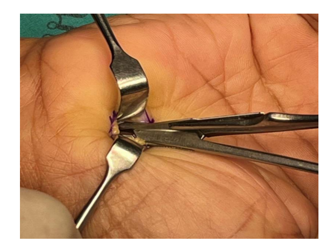
Figure 3. The subcutaneous tissue is cleared