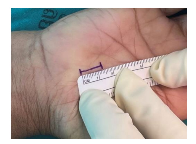
Figure 1. locating the incision site and specifying the wound size